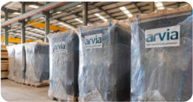
Nyex-a reactors ready for installation into the treatment basin at a client's site.

Arvia was employed to work with an agrochemical manufacturer to help treat its wastewater in Israel. The wastewater was from an agrochemical manufacturer who wanted to meet the industry standard with its wastewater discharge. The objective of the project was to assess the effectiveness of the Nyex™ treatment system in reducing the total herbicide concentration in the wastewater to UK drinking water standards, from 1.1 mg/L to <0.001 mg/L. The manufacturer was keen to show its commitment to protecting the environment through the removal of micropollutant compounds in discharge water. The concentrations of 5 different herbicides: Imazomox, Florasulam, Nicosulfuron, Imazapyr and Clomazone were studied before and after treatment with the system.