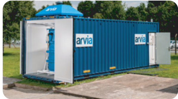
Figure 2: Nyex™ containerised system

The trials were carried out on Arvia's laboratory scale Nyex 1-20a system (figure 1).