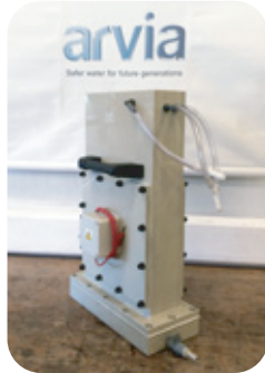
Figure 1: Nyex 1-20a

Unlike granular activated carbon, Nyex™ media is effectively regenerated in-situ and the process can continue without interruption or replacement. Results are achieved without chemical dosing or the generation of sludge, reducing costs in terms of transport of chemicals and specialist waste disposal.