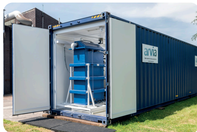
Full scale Nyex™ containerised system