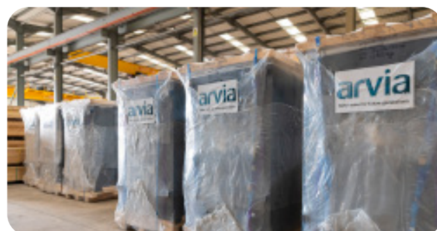
Nyex-a reactors ready for installation into the treatment basin at a client's site.

The concentrations of 5 different herbicides: Imazomox, Florasulam, Nicosulfuron, Imazapyr and Clomazone were studied before and after treatment with the system.