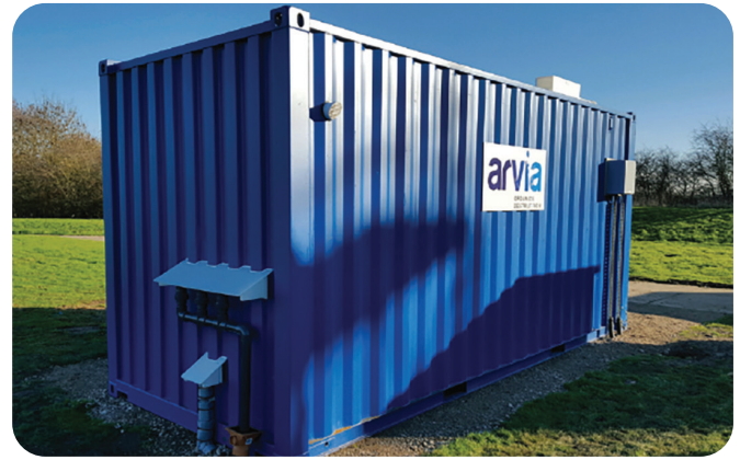
Containerised Nyex™ Treatment System on site at Anglian Water