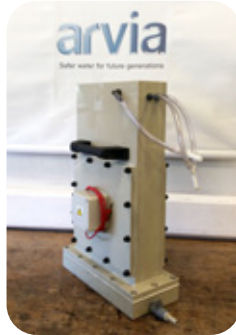
Figure 1: Nyex 1-20a

Unlike granular activated carbon, Nyex™ media is effectively regenerated in-situ and the process can continue without interruption or replacement. Results are achieved without chemical dosing or the generation of sludge, reducing costs in terms of transport of chemicals and specialist waste disposal.