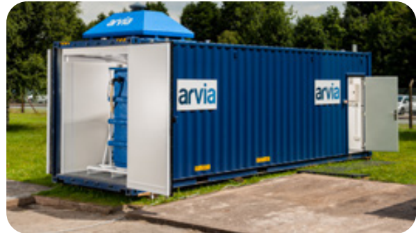
Figure 2: Nyex™ containerised system

The trials were carried out on Arvia's laboratory scale Nyex 1-20a system (figure 1).