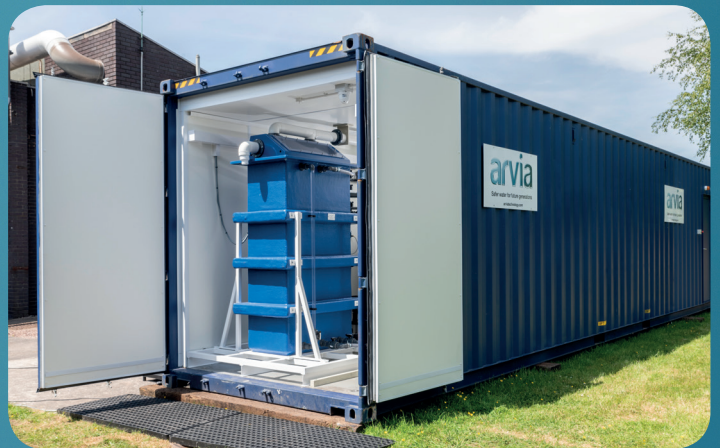
Full scale Nyex containerised system

Successful removal of CPC will prevent the need for transporting wastewater off-site to achieve the required treatment levels. The ongoing process of trucking wastewater off-site is not only costly but also has negative environmental implications.