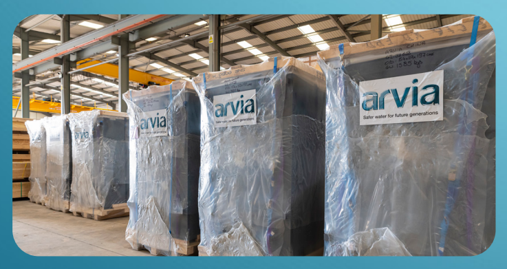
Nyex-a PLUS reactors ready for installation into a treatment basin at a client's site.

The concentrations of 5 different herbicides: Imazomox, Florasulam, Nicosulfuron, Imazapyr and Clomazone were studied before and after treatment with the system.